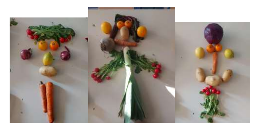
Step 11 : use the fruit to create a fruit salad that will be the collective snack of the day.

Step 10 : Projection of the photos of the faces created by children on the interactive whiteboard and final comparison on the work done. Each group explains the work, indicating the part of the face and the relative fruit or vegetable: example "I used grapes for eyes."