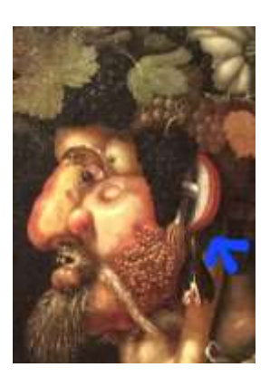
Step 4 : The teacher explains the meaning of the various images and sensitizes children that each fruit and vegetable belongs to a certain season.

Step 3 : Teacher asks "What is it?" and pupils answer fruits or vegetables, then the teacher asks "which fruit/ vegetable is it?" and pupils answer with the right name. After that, the teacher asks "What part of the face is it?" And Children answer with the right name.